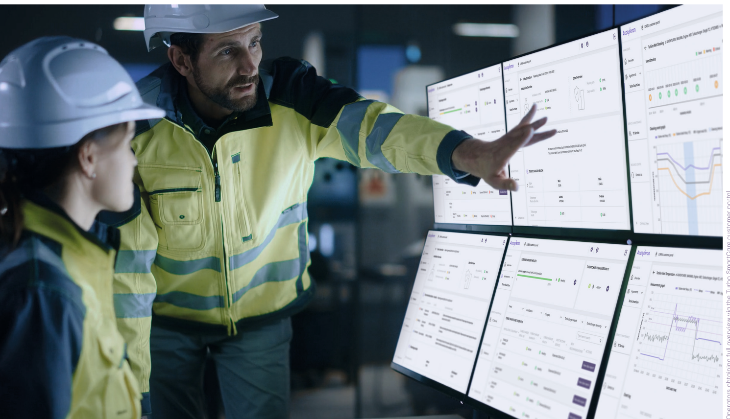
Operators obtaining full overview via the Turbo SmartCare customer portal

Turbo SmartCare is a data enabled service agreement optimized for your specific medium-speed, four-stroke engine turbocharger.